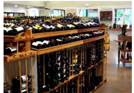
Adjacent to The Market, Long Ridge Wine & Spirits makes it convenient to stop and pick up a bottle of wine while grocery shopping.