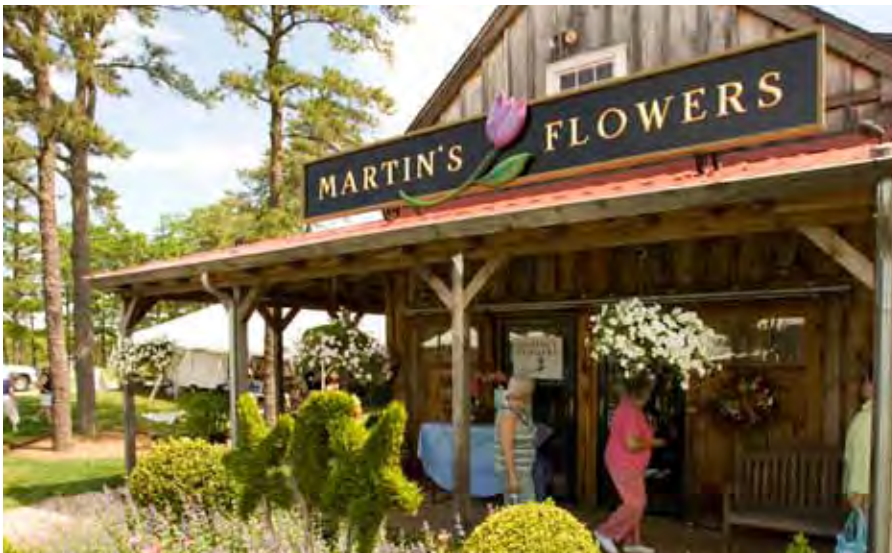
Martin's Flowers has been a Village Green retail destination since 2004 and specializes in floral designs for home, holidays and weddings.