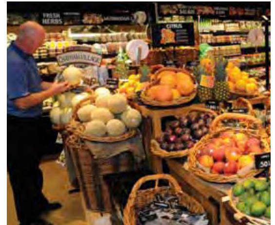
The Market grocery store averages 7,000 customers per week — drawing nearly 70% from the greater South Shore.