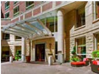
Hotel Marlowe by Kimpton Hotels