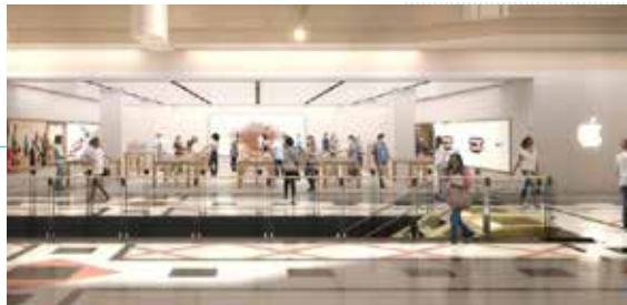
Rendered perspective of Apple's next generation store at CambridgeSide