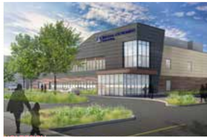
The new Brigham and Women's Health Care Center–Westwood is scheduled to open at University Station in the fall of 2018. Once fully operational, the center will offer primary care, urgent care, and more.