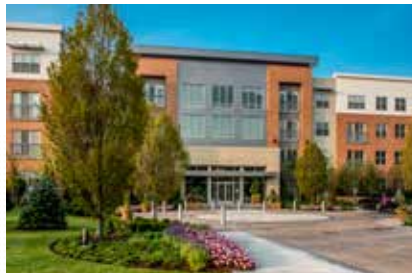
Gables University Station, situated along University Avenue, is a luxury apartment community featuring 350 units located just steps away from the MBTA and Amtrak Station.