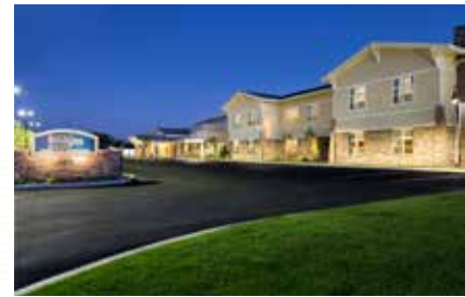
Bridges® by EPOCH at Westwood is a memory care assisted living community where remarkable people deliver exceptional care to those with Alzheimer's disease and dementia.