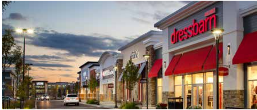
University Station features 750,000 square feet of retail and restaurant uses, including anchor tenants Target and Wegmans, plus Life Time Athletic.

University Station features 2 million square feet of retail, office, residential, and hotel uses on 120 acres in Westwood, Massachusetts.