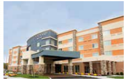
The Courtyard by Marriott opened at University Station in October of 2017. The hotel features 130 guest rooms thoughtfully designed to provide the optimum balance between work and relaxation.