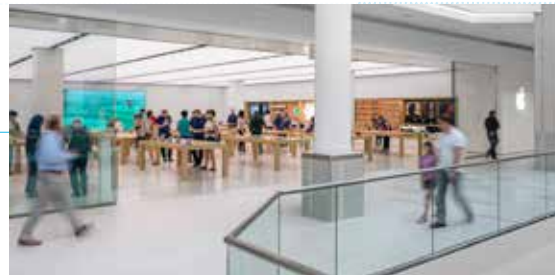
Apple's next generation store at CambridgeSide